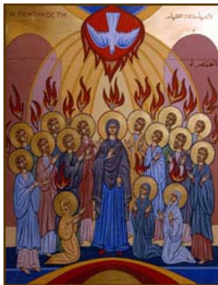
ICON OF THE PENTECOST