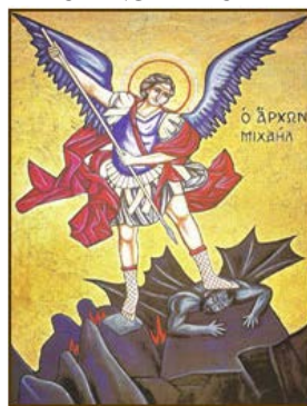
ICON OF: ARCHANGEL MICHAEL