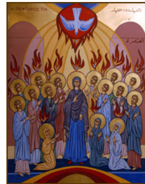
ICON OF: THE PENTECOST