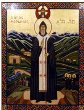
ICON OF: ST. MARON