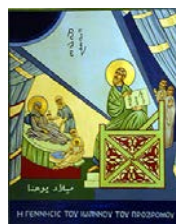
JOHN THE BAPTIST