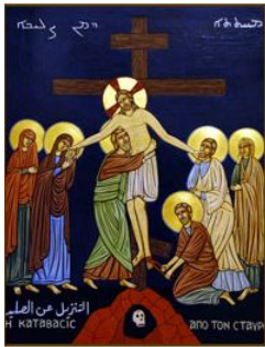
DESCENT FROM THE CROSS