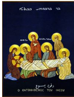
BURIAL OF OUR LORD