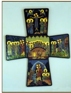
CROSS OF HOLY WEEK