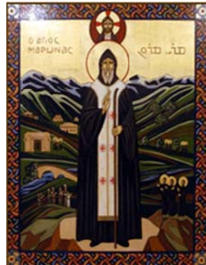
ICON OF: ST. MARON