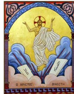
ICON OF: GLORIOUS RESURRECTION