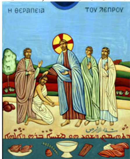
Have A Blessed Week,